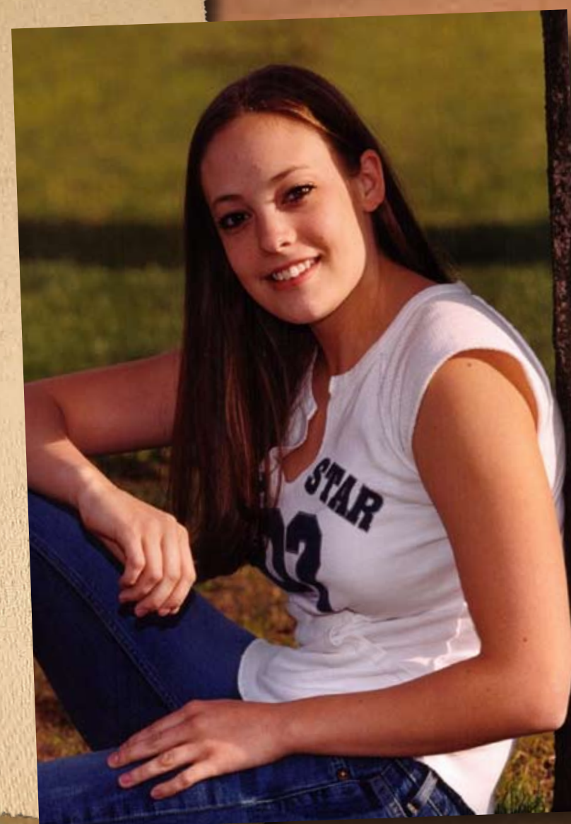
Killed by a drunk driver April 9th, 2004

Don't forget me 'Cause you know I love you Don't worry, for I've been watching you Because sometimes...Life is not perfect